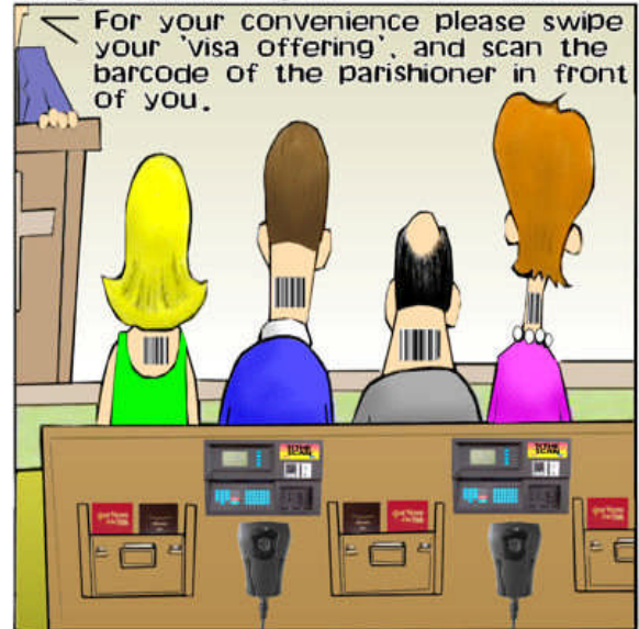
MEET THE FUTURE OF SUNDAY MORNING CHURCH Credit card Offertories and bar code attendance