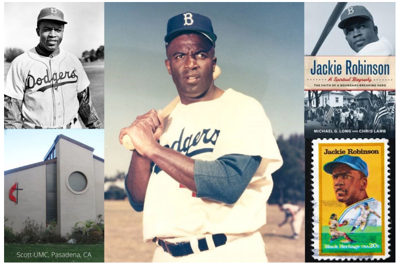
Baseball great Jackie Robinson, who helped integrate Major League Baseball, held on to his Methodist faith throughout his legendary career.

But Robinson held his desire to retaliate in check in the interests of the greater good. If he had failed, many Black baseball players wouldn't have gotten a shot in the big leagues.